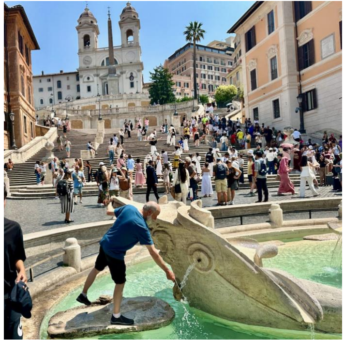
Cooling off in Rome, near the Spanish Steps.