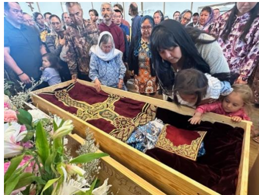
M. Xenia and others venerating the relics of Saint Olga.