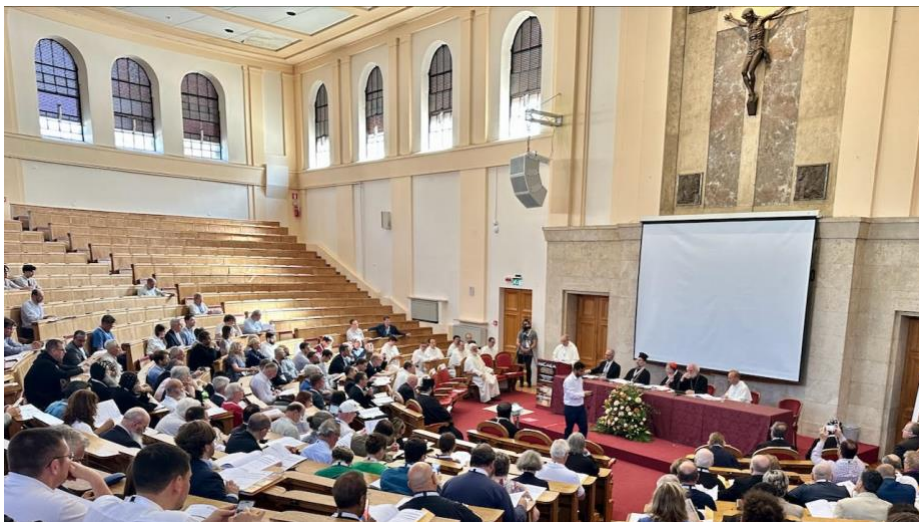
This was the opening session of the Conference in the Angelicum.