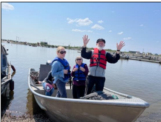
Pilgrims arrived in Kwethluk by a shuttle of fishing boats that ran about 20 miles up the Kuskokwim River.