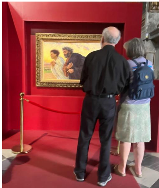
Coincidentally, this beloved painting by Eugene Rumand, “Peter and John Running to the Tomb,” was on display for a few days only a few blocks from our hotel in Rome.