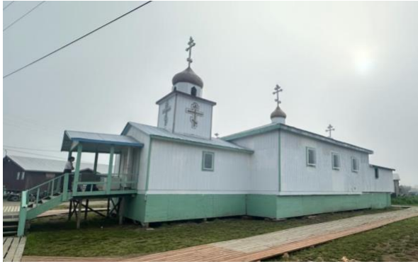
St. Nicholas Church in Kwethluk.